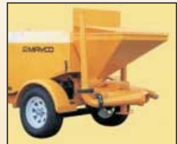
3" x 2" reducer is standard; swings up and away for easy travel and cleaning

Full specifications are on the back cover.