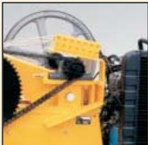
Central lubrication system for quick and easy maintenance.