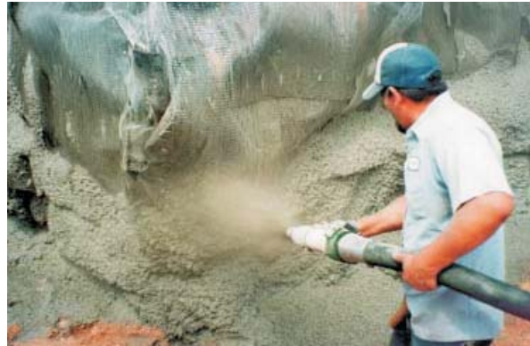
The C-30E5 is ideal for shotcrete applications of stiff, low slump mixes — swimming pools, ditch linings, soil stabilization, walls and more.

Service is simplified by a central lubrication system that enables the operator to quickly grease every critical service point. A fully enclosed lube box provides positive lubrication and can be easily cleaned out.