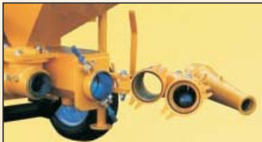
Innovative E-Z open hinged manifold and reducer; no special tools required for service or maintenance.